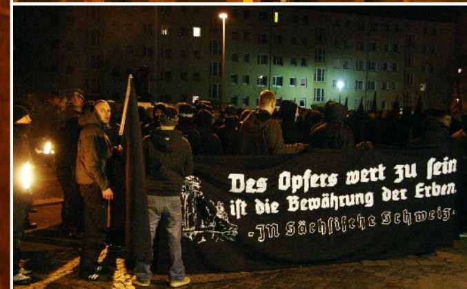
Torch march of the „Aktionsbündnis gegen das Vergessen“, 13 February 2009