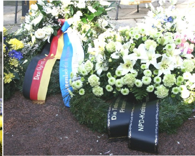
Wreath of the extreme right NPD covers wreath of the Central Consistory of Jews in Germany